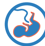
COMPLICATIONS IN PREGNANCY